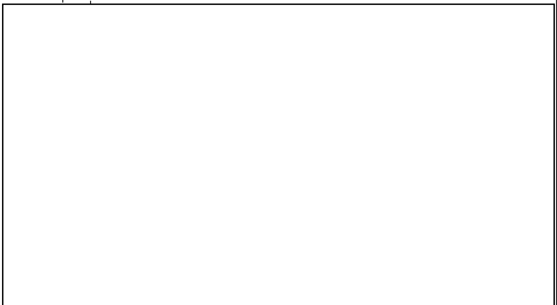
Figure 1: Figure, table or photo can span one or both columns -- or more than one column, if you wrap text around it. Put "Figure X" in bold and left-justify it.

(Fill columns all the way to the bottom)